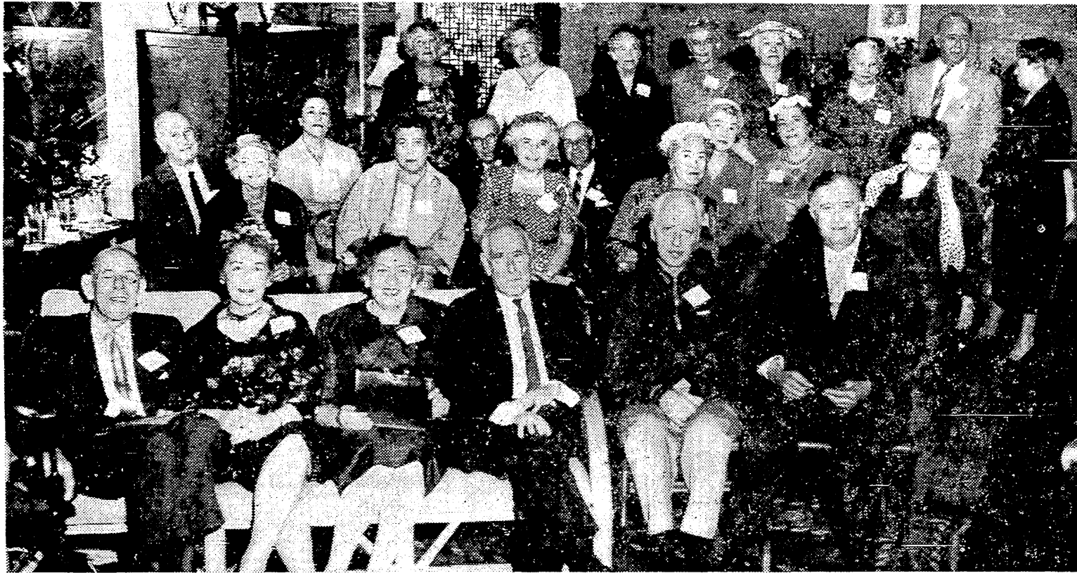
The old classmates in Pacific Heights elementary school were happily nostalgic in Belvedere reunion

After an impromptu demonstration of parlor magic—